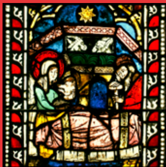
14 th century stained-glass window in St Etienne Church, Mulhouse.

The crèche shows the nativity of Jesus. It is one of the symbols of Christmas in Alsace. In Mulhouse, the crèche will be set up on Place des Victoires. According to tradition, the baby Jesus is only placed in the manger after midnight on Christmas Eve, but visitors can see all the characters in the nativity scene beforehand.